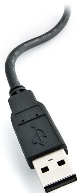
Figure 2: A standard USB type "A" connector.

The Kvaser Hybrid 2xCAN/LIN has a standard USB type "A" connector.